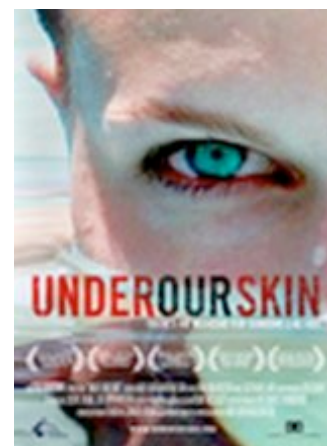
Under Our Skin - Poster Art Open Eye Productions